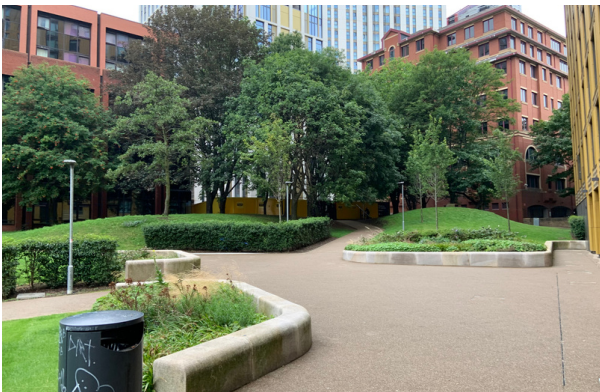
Vita Accommodation Leeds 972m 2 Flexistone Sweet Pea blend