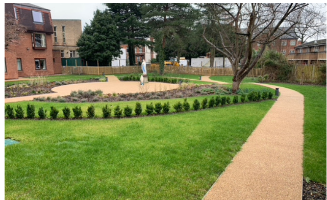
St Joseph's care home Ardwick 831m 2 Flexistone Barnsley Solo blend